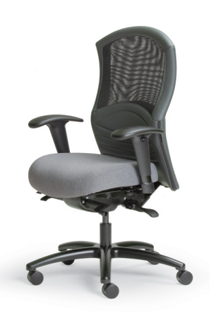
SMALLER POSH MESH