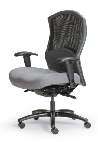
LARGER POSH MESH

Designed to be the most exquisite mesh chair in the world, this chair combines the comfort and breathability of suspension mesh, advanced ergonomic support, and beautifully tailored details.