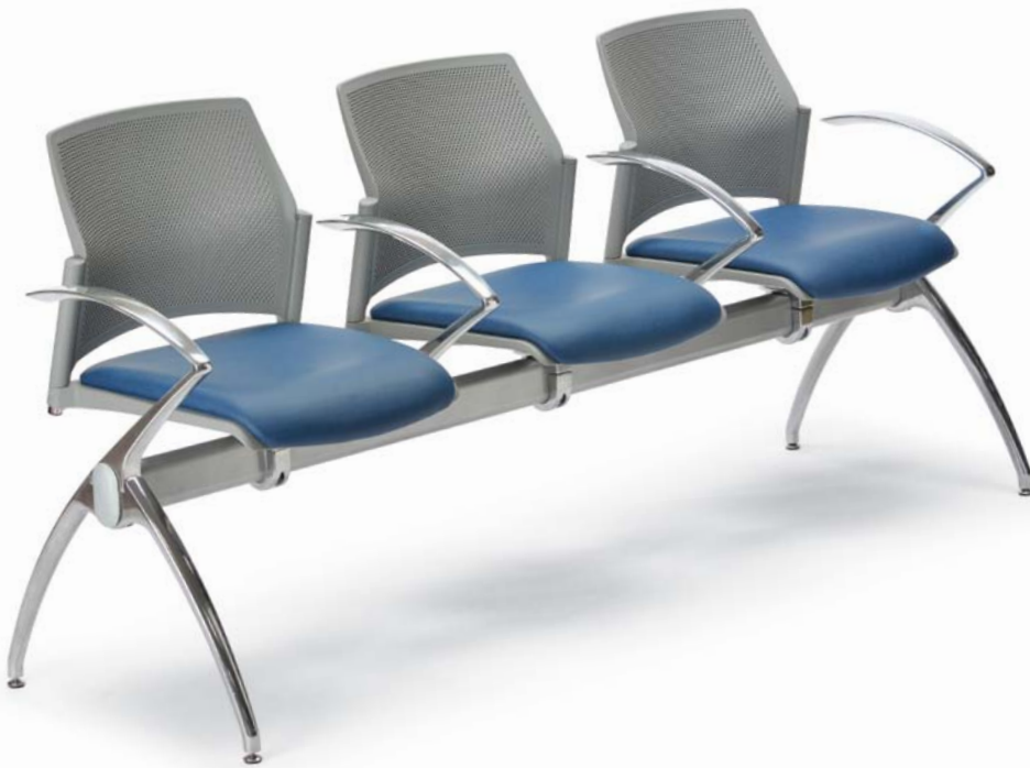
Easy™ Beam, 3 position, AeroBeam™ frame upgrade with upholstered seats and shared arms and final arm.