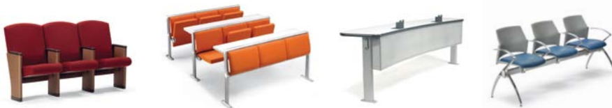
Auditorium and Public Seating

For further information on our comprehensive range of seating please visit our website or call our toll free number. Specifications are subject to change without notice.