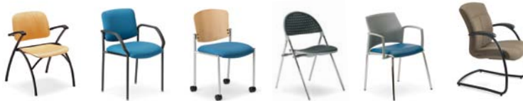
Guest, Stacking and Multi-Purpose Seating