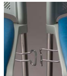
Retractable Ganging Clips