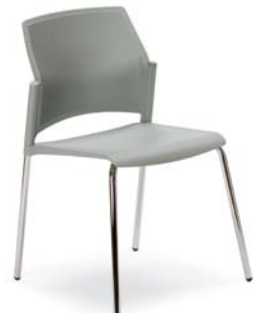
Easy™, four-leg frame, poly, armless 962 FL