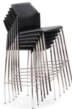
Easy™ stools stack 6 high on the ground and 8 on the cart; armless only 964 FL