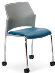
Rolling Easy™, four-leg frame, upholstered seat, armless 962 FL RE