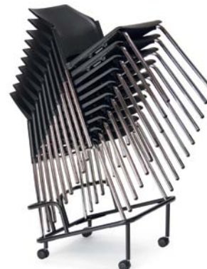
Easy™ cart holds 10 chairs; Easy chairs stack 8 on the ground; with or without arms 969