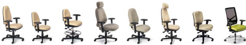
Task and Operational Seating