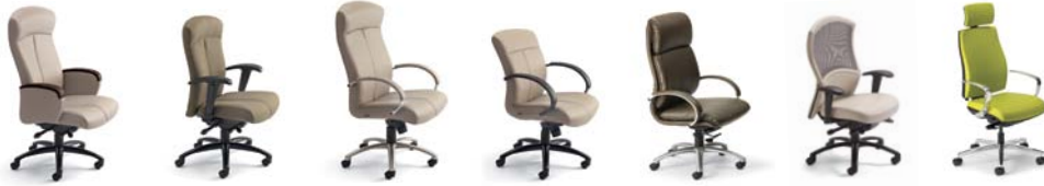
Management, Executive and Conference Seating