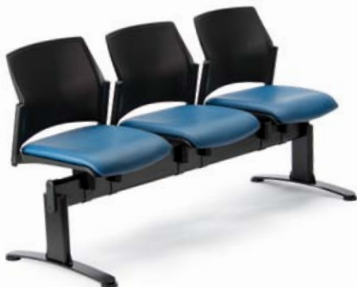
Easy™ Beam, 3 position, standard beam, upholstered seats, armless 9603 FF