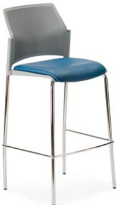
Easy™ stool, four-leg frame, upholstered seat, armless 964 FL