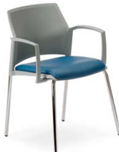
Easy™, four-leg frame, upholstered seat and dedicated arms 962 FL DA